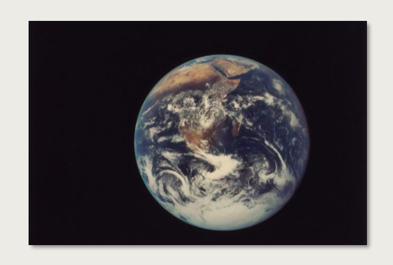
Lack of geographical boundaries